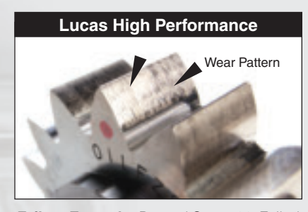
Failure Example: Passed Stage 11, Failed Stage 12, Total Wear in Stage 12, 160mm