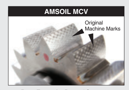
Pass Example: Passed Stage 13, Total Wear, 0mm